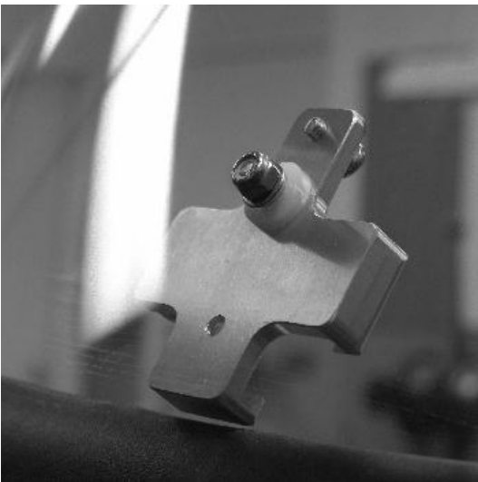
3. Attach Adapter To Windshield As Shown.