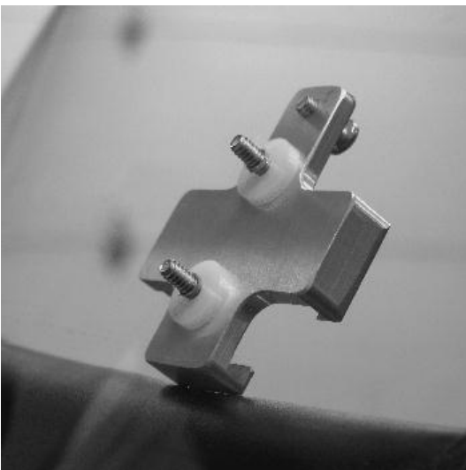
5. Remove Adapter, Replace Adapter with 5/8 dia. Washers In Between Adapter and Windshield.