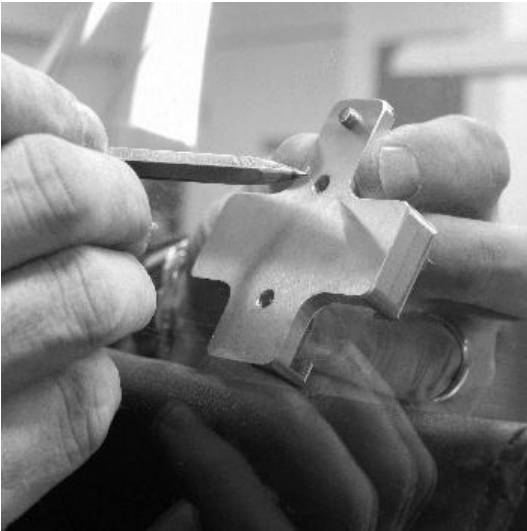
1. Scribe Top Hole Center On Windshield.