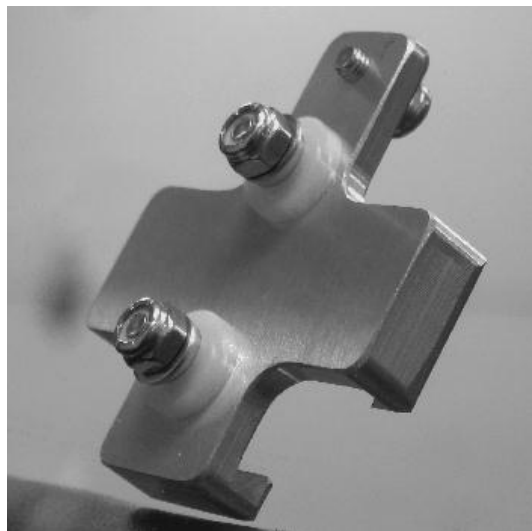
6. Fasten Nylon Washers, S.S. Washer and Nuts Completing Installation.